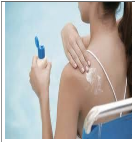
Sunscreen Changes for Boaters....

In August of 1978, the Food and Drug Administration (FDA) announced it would be making rules to govern the labeling of sunscreen, writing in the Federal Register that "the issue is important and requires careful study." That study took 33 years; new rules were announced during June 2011. Among the new labeling requirements, as of the summer of 2012, manufacturers may no longer claim that sunscreen is "waterproof" or "sweatproof", or call their product "sunblock." Water-resistance claims must be backed by testing, and any product alleging to provide instant or extended protection from the sun must submit data to back those claims. All sunscreens will need a "drug facts" label on the container. Sunscreens claiming to be "broad-spectrum", that is, blocking both UVA and UVB types of ultraviolet light, will need to pass an FDA test to verify it, and only those passing will be able to claim to reduce the risk of skin cancer. The American Academy of Dermatology recommends using broad-spectrum sunscreen of at least SPF-30, even on cloudy days, and (no matter what it says on the label) reapplying it every two hours or after swimming.